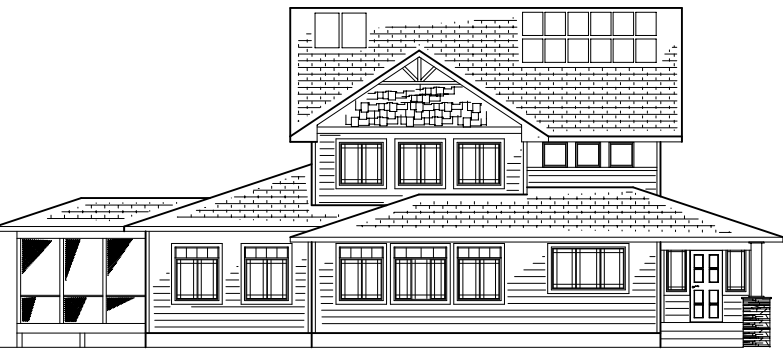
SOUTH ELEVATION "A"