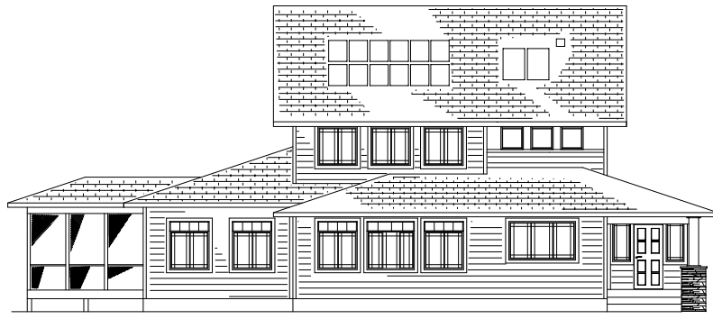
SOUTH ELEVATION "B"